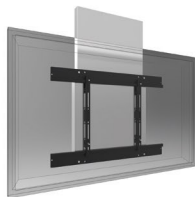
Universal VESA Bracket Included