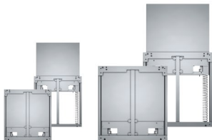
Choose from BalanceBox 400 or 650 based on screen size