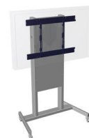
Optional mobile stand