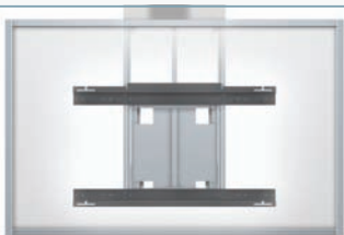
SMART® whiteboard frame