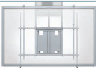
Universal whiteboard frame